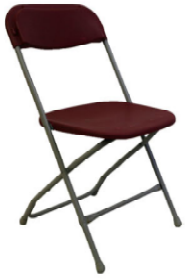
Plastic Folding Chair