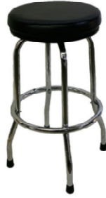
Stool Without Back