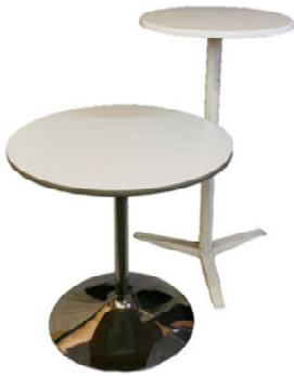
Pedastel and Cruiser Table