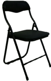
Padded Folding Chair